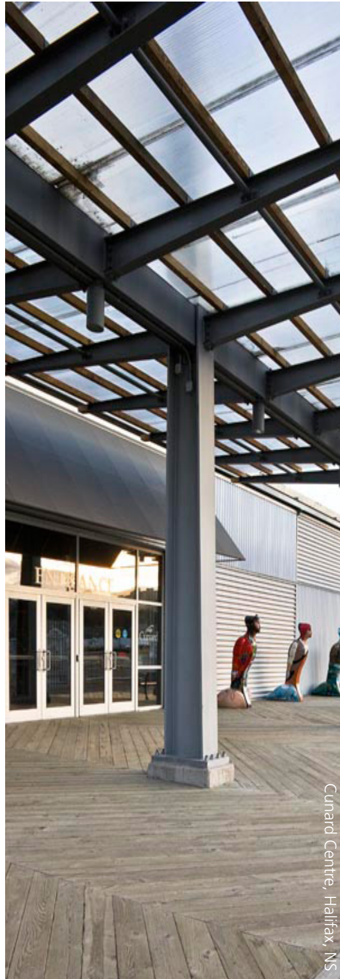
Cunard Centre, Halifax, NS

Location: Construction Association of Nova Scotia (CANS) 260 Brownlow Avenue, Unit 3 Dartmouth, Nova Scotia