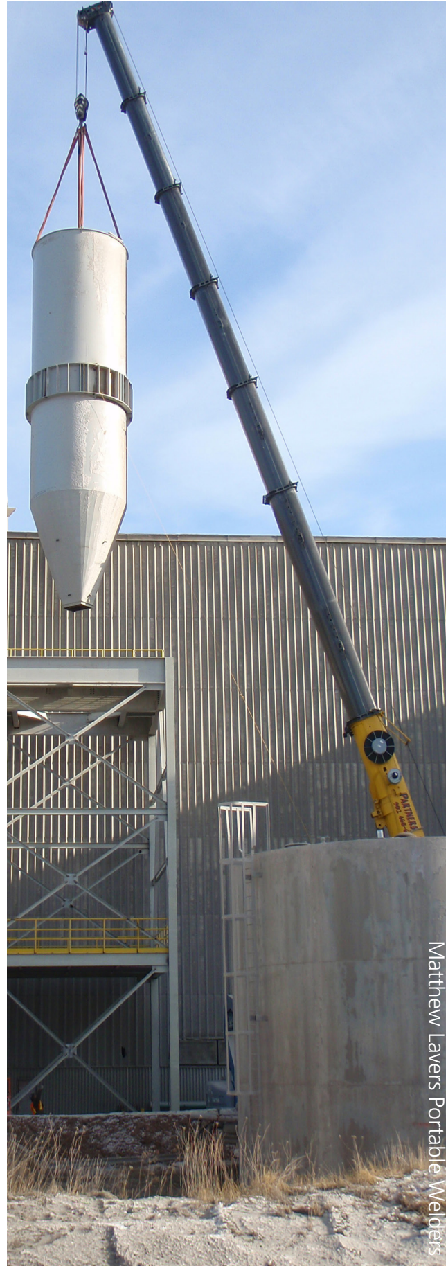
Matthew Lavers Portable Welders

This module covers the pre-construction process and how project estimates are compiled, how to compare actual project costs with those estimated, and how to control costs to meet the estimate. Participants will also learn the value of effective supervision of workers to improve the Supervisor's ability to manage costs in the construction process.